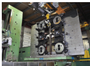
Subway Undercarriage Parts