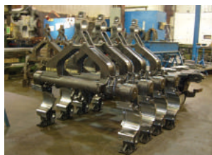
Subway Undercarriage Parts