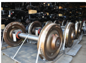
Subway Rail Wheels