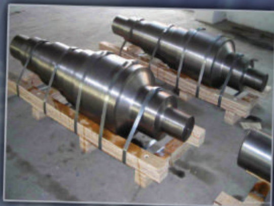
Large & Small Forgings For OEM Equipment