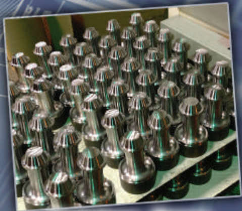
Stainless, Brass, and Alloy Parts

Our Engineering Team can Help Improve or Redesign Your Volume Manufactured Products, With a Focus on Cost Reduction, Quality, and Extended Lifecycle.