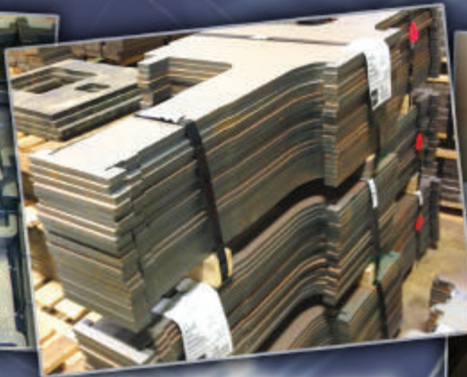
Laser Cutting and CNC Forming