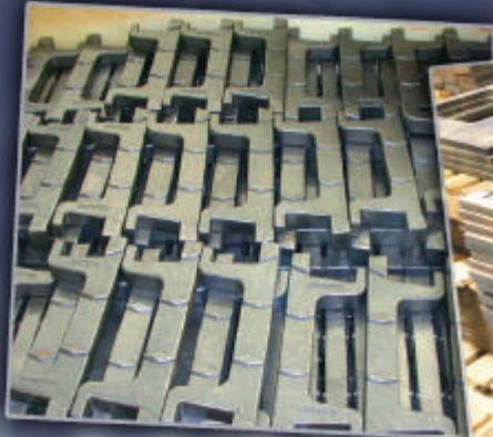
Casted Parts Large and Small

Steel - Aluminum - Stainless - Brass - Composites