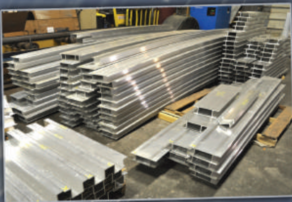
Aluminum Forming and Machining