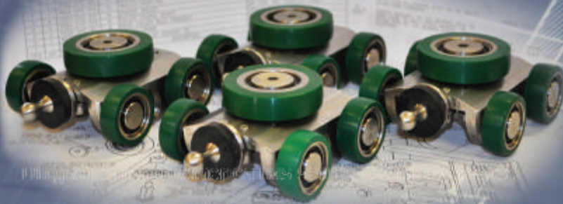
Custom Designs and Prototypes

Our Engineering Team can Help Improve or Redesign Your Volume Manufactured Products, With a Focus on Cost Reduction, Quality, and Extended Lifecycle.